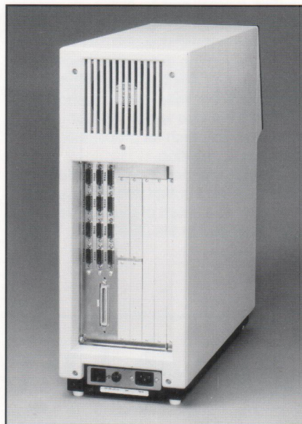
Easy access to expansion slots and connector panels

DS90-30S is also an exceptional system for program development. The D-NIX operating system provides the base for a large number of development utilities, as well as conventional programming languages and 4GL tools.